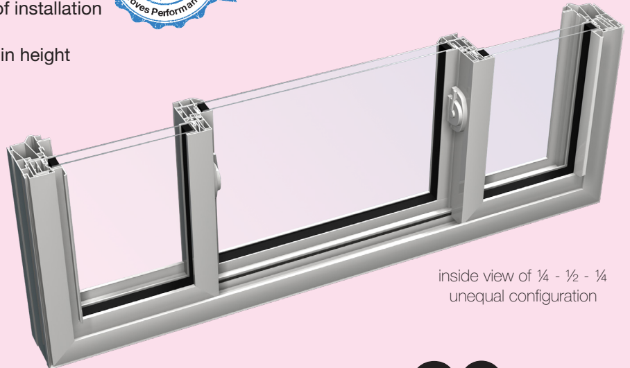
inside view of 1/4 - 1/2 - 1/4 unequal configuration