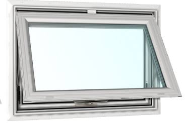
MODEL 9100 (NEW CONSTRUCTION)