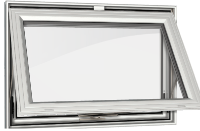
MODEL 8100 (REPLACEMENT)